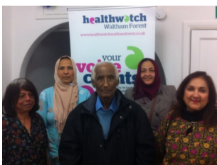
Quiz team winners from the Asian Seniors Group